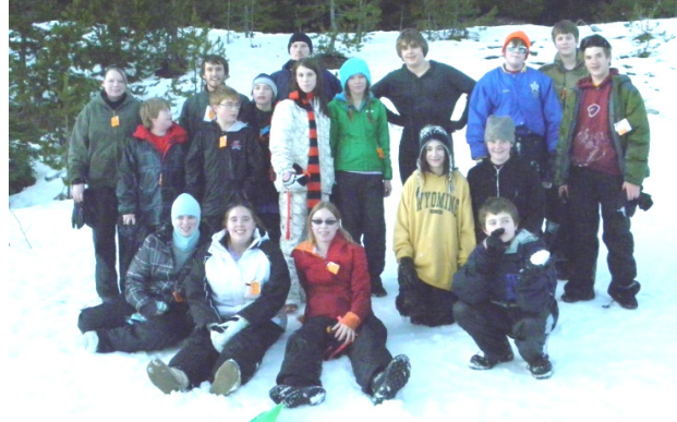
Inner tubing on the mountain, January 8, 2012

Our church joined with six other Lutheran church's for a broomball game and then joined Accession Lutheran at Portland Lutheran School for a lock-in the rest of the morning. There were over 50 youth for the broomball and about a dozen for the lock-in. We are thinking of having a servant event with another church or two on a once a month basis, either with My Father's Heart or Bridgetown Ministries.